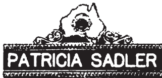
Engraved Metal Brooch Code LA2 $12.00