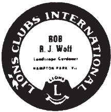
Members Dinner Badge (90mm)