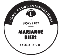
Lions Lady Badge (55mm)